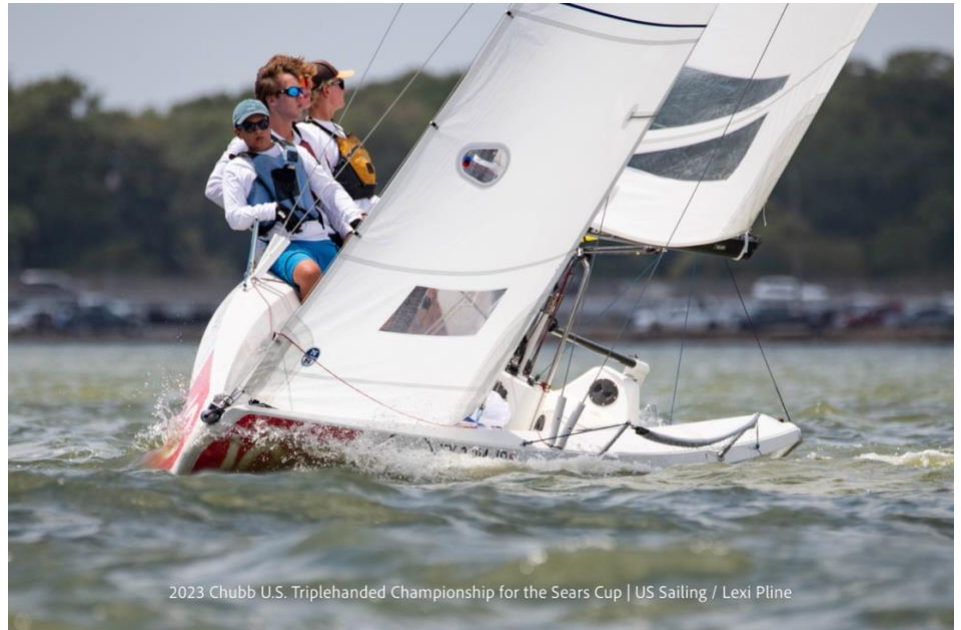
2023 Chubb U.S. Triplehanded Championship for the Sears Cup

and we were amazed at the small technical aspects that won or lost a race. I had an amazing experience and learned that I have a lot still to learn.