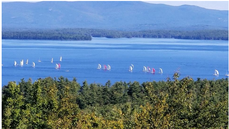
J80 Glory on Winnepesaukee