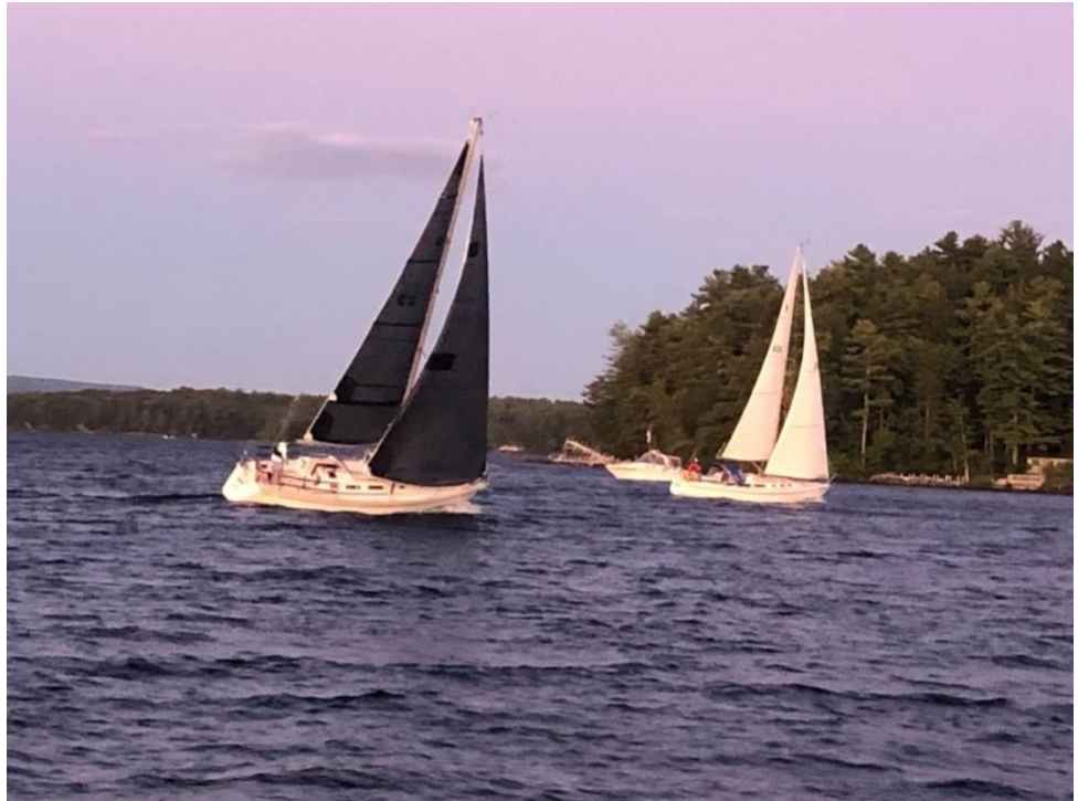
Single Hand PHRF Racing