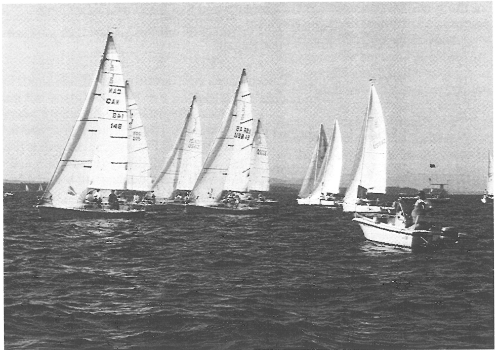
The J/80 fleet comes off the starting line at the 1998 J-Jamboree North. See story and more photos on page 5.