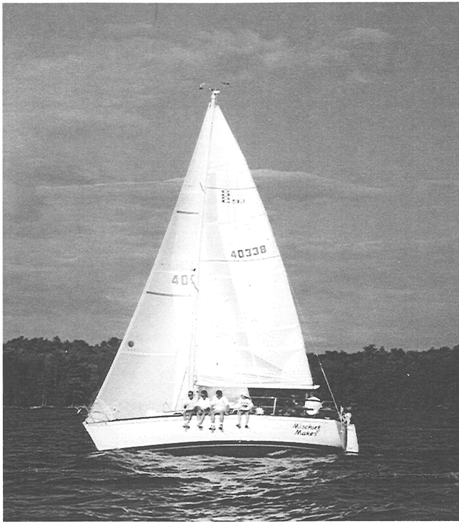
Mischief Maker in The Night Owl Express