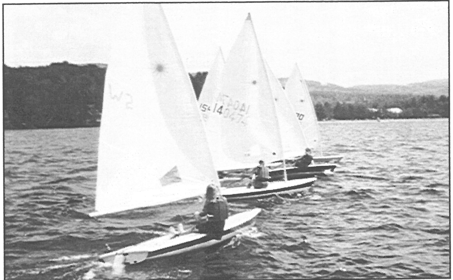
A clean start at the Area A Leiter Cup Finals held in Sander's Bay.