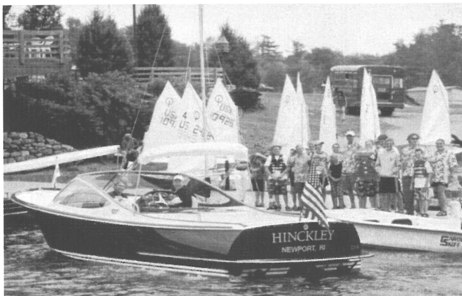
The kids from the Youth Sailing School wonder if the Hinckley is the LWSA's newest addition to the fleet!!!

"I would like to thank you for granting scholarship money to _____ this year. In past years I was able to send _____ without help. This year I needed help and you were able to give it to me. My children have great memories of these years, and talk about their experiences throughout the year.