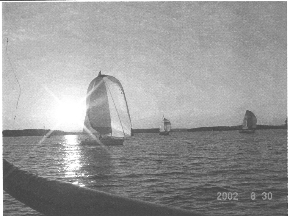
This sundown view of boats sailing in the Frying Pan Race seems appropriate for the end of year issue.