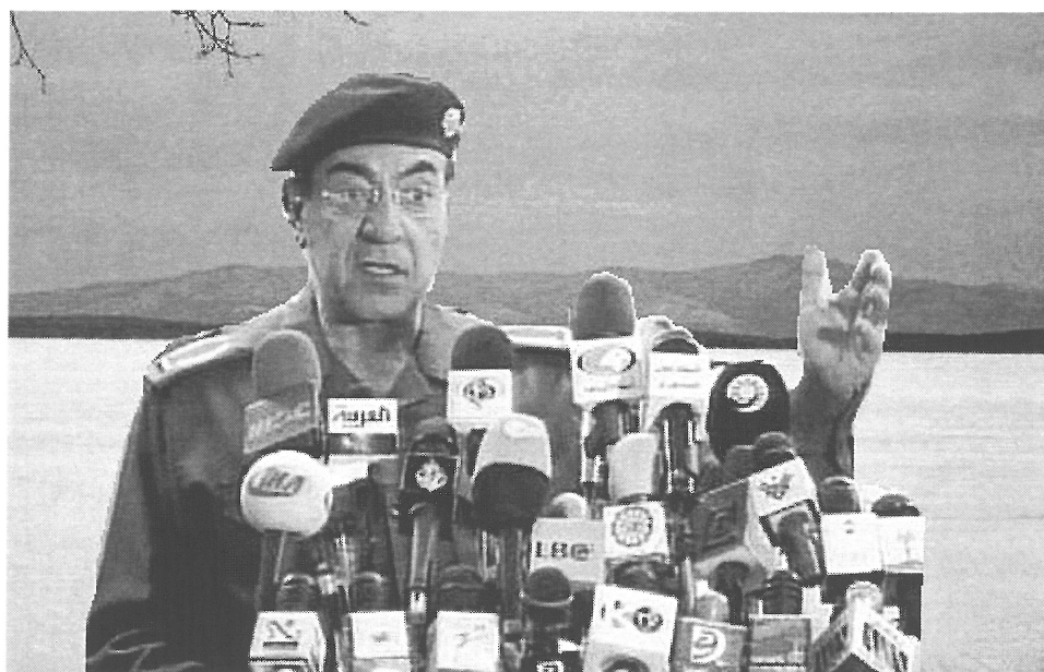
Iraqi Information Minister declares Ice Out for Lake Winnepesaukee on April 14

The LWSA stays afloat through the efforts of its volunteers, through your memberships and generous donations, and through the donation and resale of boats. You should know that last year we sold a Capri 25, a catamaran and an outboard, and currently have three substantial boats for sale, listed elsewhere in this issue. Please keep your eyes open for prospective donors and buyers, and please join the LWSA!