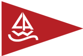
Lake Winnepesaukee Sailing Association