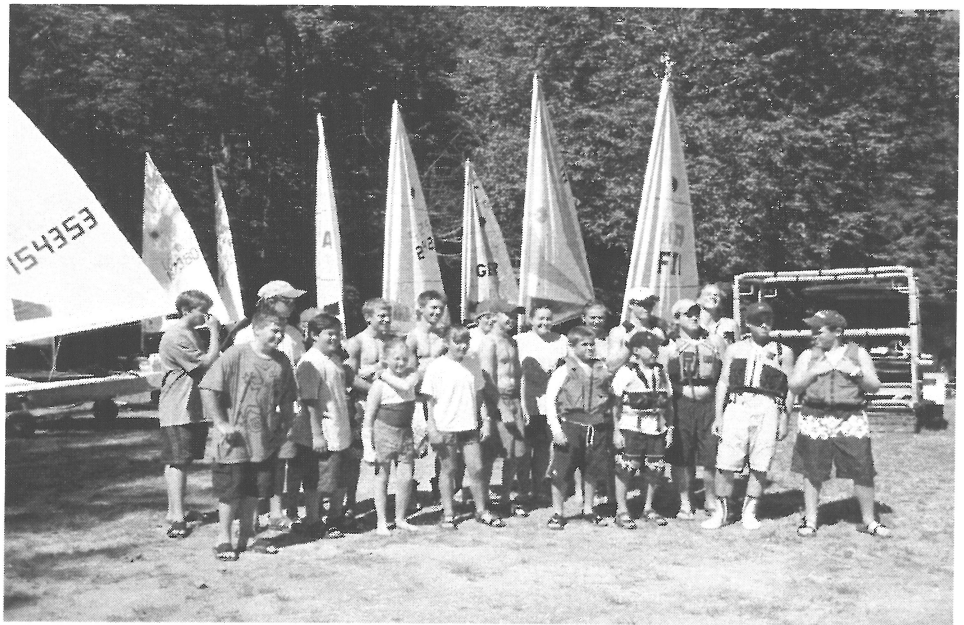
Our young sailors really enjoyed competing in last year's Youth Regatta

The LWSA stays afloat through the efforts of its volunteers, through your memberships and generous donations, through the donation and resale of used boats, and through your participation . We look forward to seeing you on the lake this season. Good sailing!