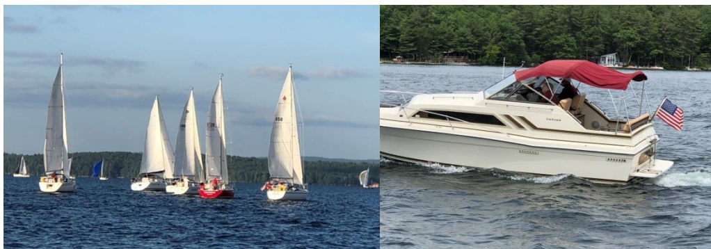
Annual Frying Pan Regatta August 31, 2018 Special K during the Poker Run on June 16

Lastly, in addition to the LWSA events, members of the LWSA PHRF fleet were also able to participate in all of the Winnepesaukee Yacht Club events including; the WYC Reverse Start Charity Event, WYC JBT Race and Auction, WYC Full Moon Classic, WYC Commodore's Cup and the ever popular season finale Cold Duck Race.