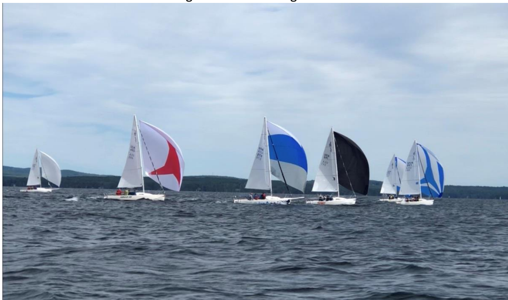
31 st Annual J Jamboree September 22, 2018