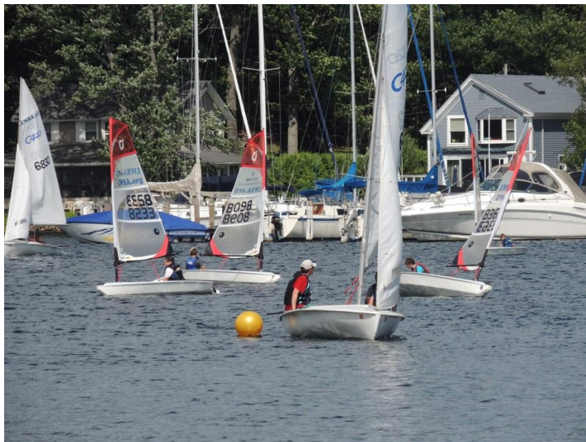
LWSA Kids doing what they do best EAT, SLEEP and SAIL